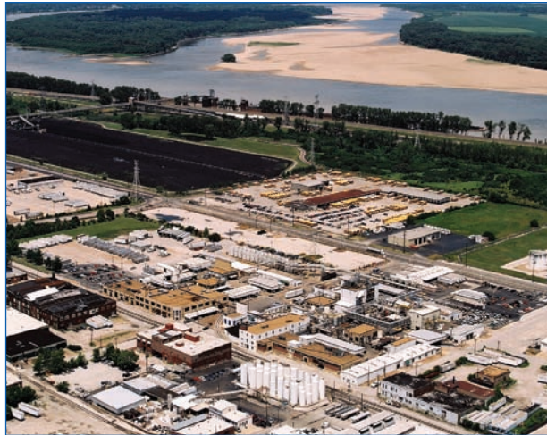
ELANTAS PDG, Inc. headquarters in St. Louis, Missouri

ELANTAS Electrical Insulation companies are strategically located throughout the world to meet the primary insulation, secondary insulation and electronic and engineering materials needs of our customers.